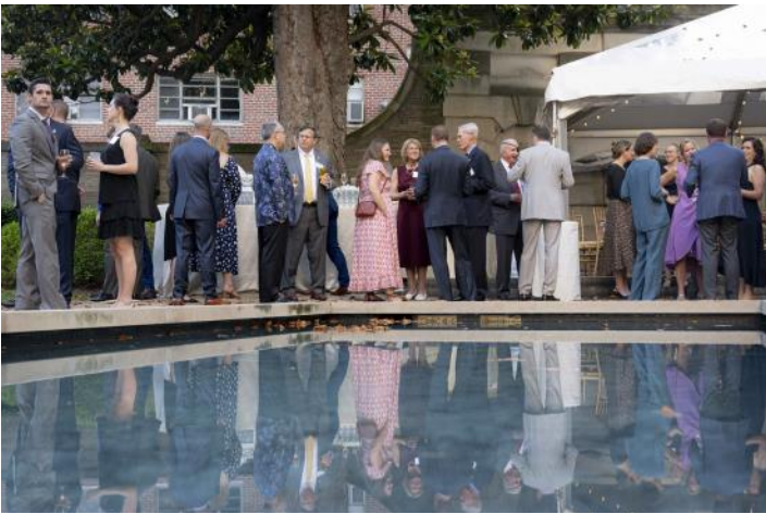
Olmsted Scholars and guests enjoy cocktails and mingle with old and new friends by the Anderson House reflecting pool.