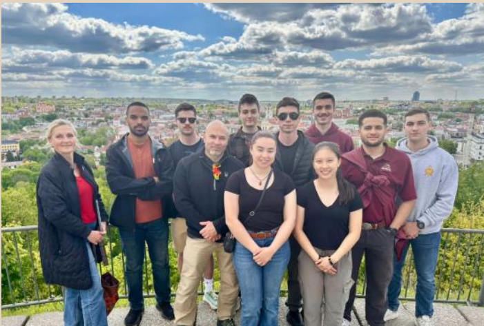
The Norwich team toured historical sites in Old Town Vilnius, Lithuania. They also visited the Miracle Stone, made famous during the fall of the Iron Curtain in 1989.

The Olmsted Foundation's Undergraduate Program offers overseas travel and cultural immersion opportunities to service academy cadets, midshipmen, and ROTC students attending or associated with Title 10 senior military colleges. This past May, a group of Norwich University cadets toured Estonia, Lithuania and Latvia.