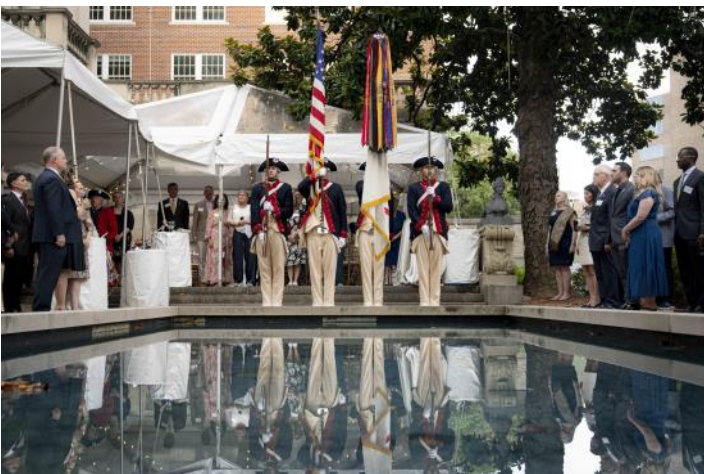
The annual meeting begins with the presentation of colors accompanied by the US Army's Old Guard Fife and Drum Corps.