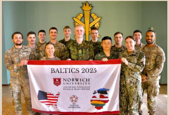
While in Tartu, Estonia, the team was hosted by the Estonian Military Academy, met with Estonian Defense Forces cadets and toured the campus and a nearby base.