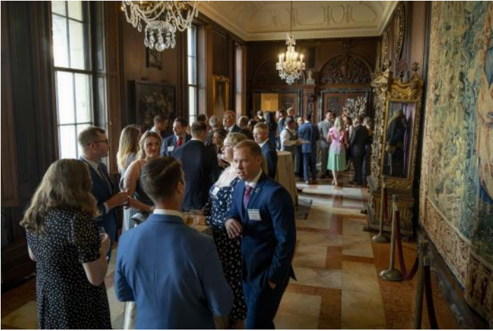
OSC 2026 is welcomed by Foundation staff, directors and distinguished guests at a reception held in the Olmsted Gallery on the second floor of Anderson House.