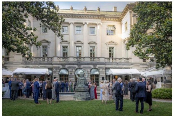
It was a beautiful evening to gather on the Anderson House lawn prior to the annual meeting and dinner.