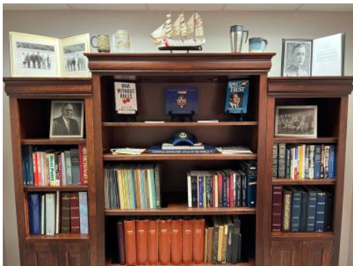
Books and memorabilia are displayed on the shelves of the new Olmsted Library.