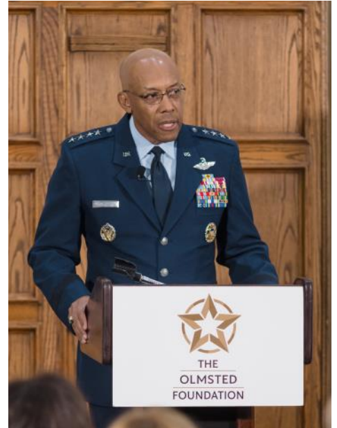
General Charles Q. Brown, Jr., Chairman of the Joint Chiefs of Staff, presents the Olmsted lecture at the National Press Club.