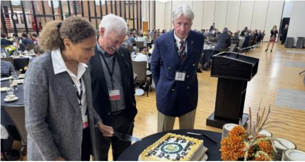
LTG (Ret.) Nadja West and a representative from the United States Military Academy class of 1971 cut the celebratory cake at the SCUSA dinner.

LTG (Ret.) Nadja West, an Olmsted Foundation Director since 2021, represented the Foundation at the recent Student Conference on US Affairs held at West Point. SCUSA is held annually and welcomes students from over 200 institutions worldwide, offering them the opportunity to work with scholars and practitioners to develop proposals that address important topics in US foreign policy.