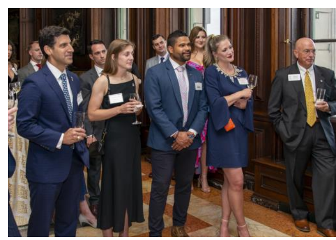
Guests gathered in the Olmsted Gallery to hear introductory remarks.