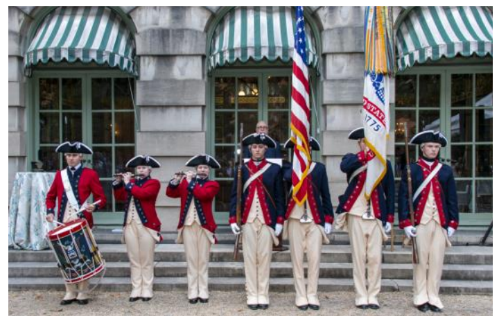
The US Army Old Guard Fife & Drum Corps presents the colors to open the Olmsted Foundation Annual Meeting.