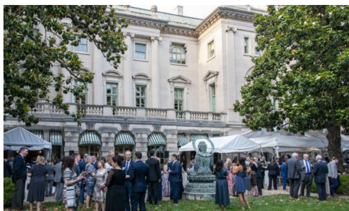
Guests gathered in the Hoyt Garden of Anderson House for a cocktail hour and the Annual Meeting.