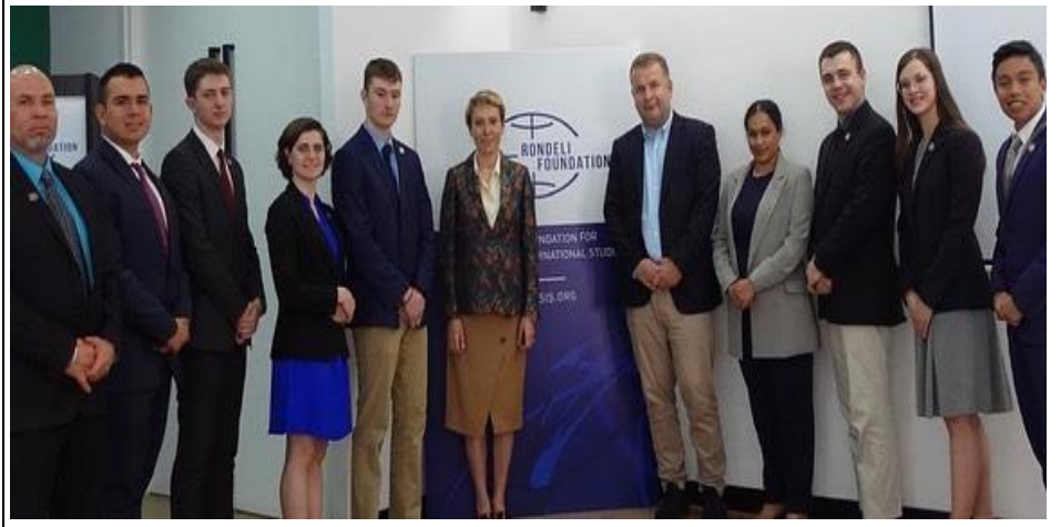
Cadets from Norwich University visited the Georgian Foundation for International Studies in Tbilisi, Georgia.

The Olmsted undergraduate program offers a great opportunity for future military officers to immerse themselves in a foreign culture and explore the world prior to receiving their commissions.