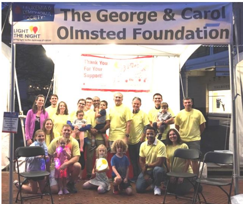
Olmsted Scholars and families gather in Reston, Virginia for the annual Leukemia and Lymphoma Society's Light the Night event.