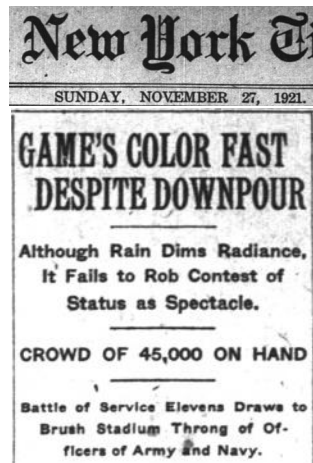
The New York Times the morning after the game.