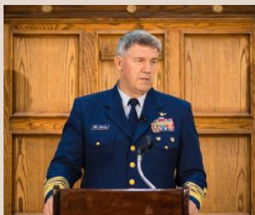
Admiral Karl Schultz presents the 2021 Olmsted Lecture.