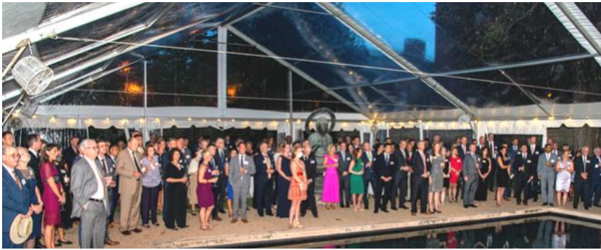
Guests gathered around the reflecting pool during the Annual Meeting.